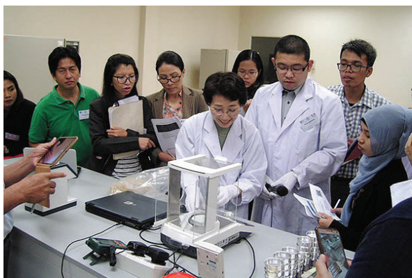
Photo 6a: Training course on rice moisture measurement in Malaysia, 2017