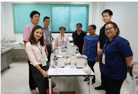
Photo 6b: Training course on rice moisture measurement in Thailand, 2018