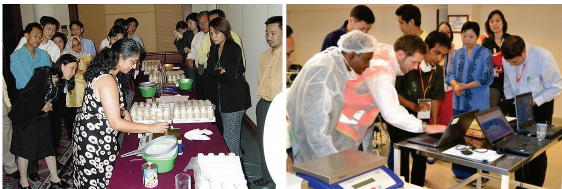
Photo 5a: Training course on prepackages in Malaysia, 2006 Photo 5b: Training course on prepackages in Indonesia, 2015

The APLMF conducted many training courses on prepackages ( Photo 5 ). The WG on Goods Packed by Measure in Indonesia coordinates training activities, e-Learning materials, and surveys on prepackages.