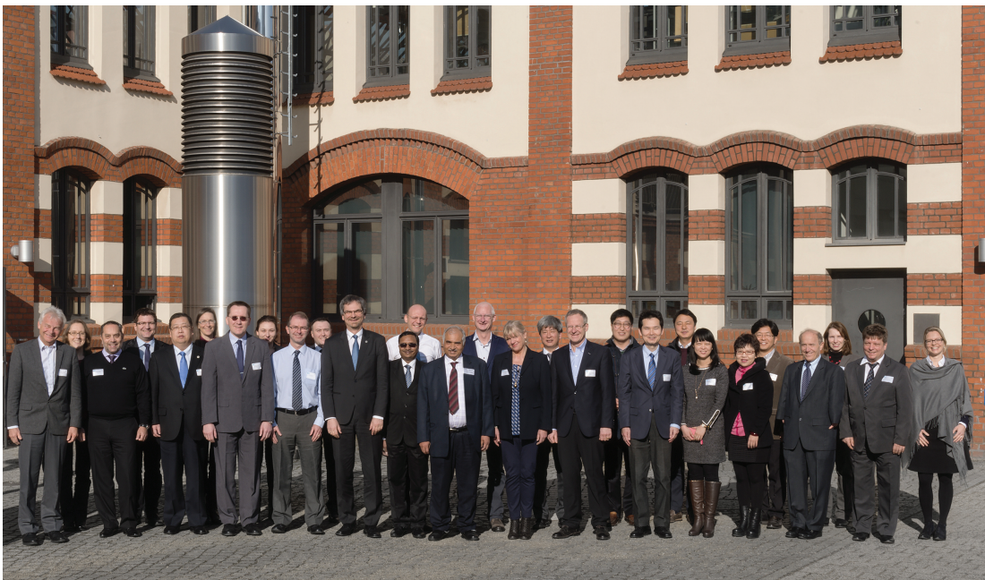
Participants in the first prMC Meeting at the PTB in Berlin, Germany