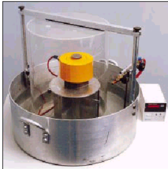
Figure C-2 The practical setup