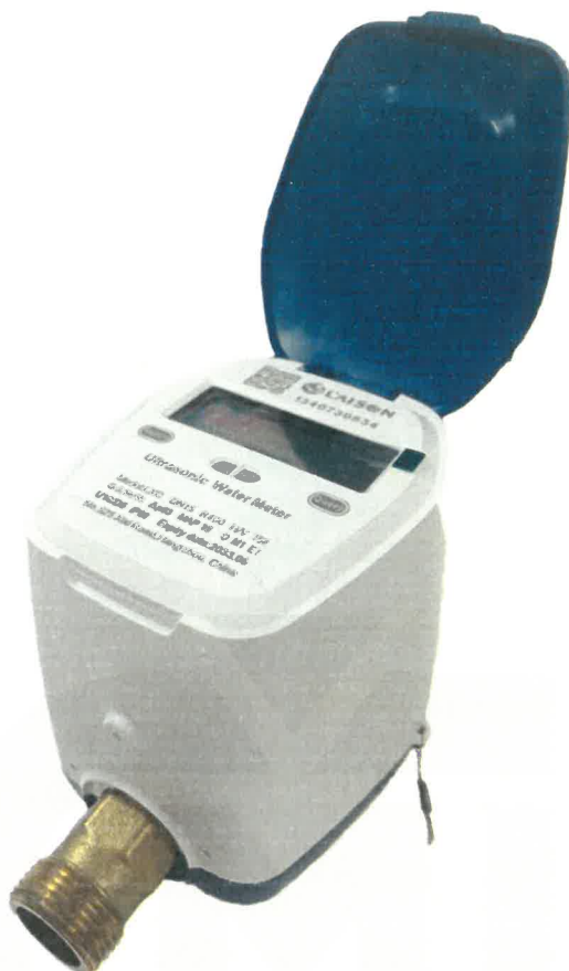
Figure 2: The water meter type LXC – marking, example of register and display: